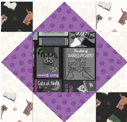
Block 2 A

Block 2 – Look at the main diagram for the layout of fabrics