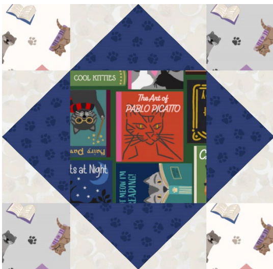
Block 2 A

Block 2 - Look at the main diagram for the layout of fabrics