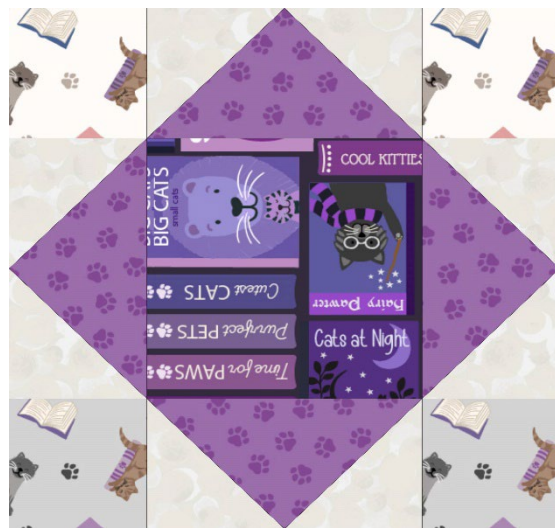
Block 2 B