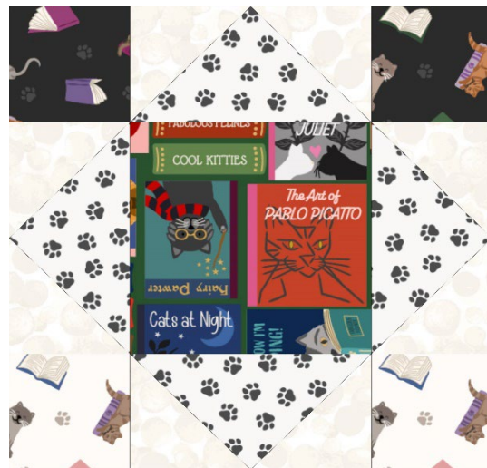
Block 2 B