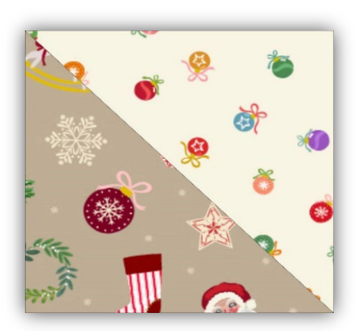
40 this way and 40 this way

Lay out the blocks a stitch in rows going down as in the main diagram.