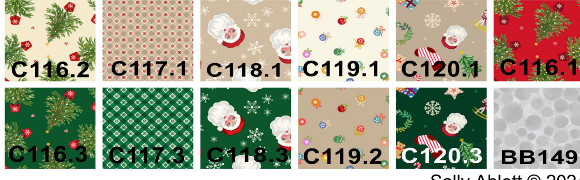
Sally Ablett © 2024

Use your favorite method from fabric 11 for binding the quilt.