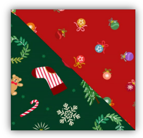
40 this way