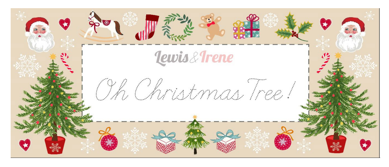
Designed and made by Sally Ablett - Throw 2

Size of runner 55" x 58" - unfinished block size 5\frac{1}{2} " x 5\frac{1}{2} "