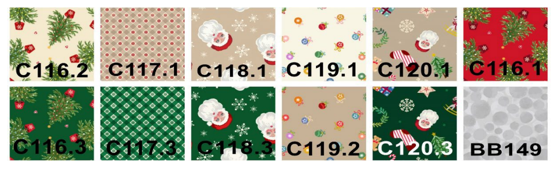
Sally Ablett © 2024

Use your favorite method from fabric 11 for binding the quilt.