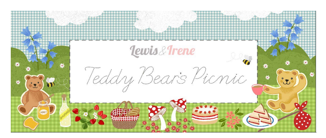
Designed and made by Sally Ablett - Throw 1

Size of runner 50" x 50" - unfinished block size 24\frac{1}{2} " x 24\frac{1}{2} " - 12\frac{1}{2} " x 12\frac{1}{2} "