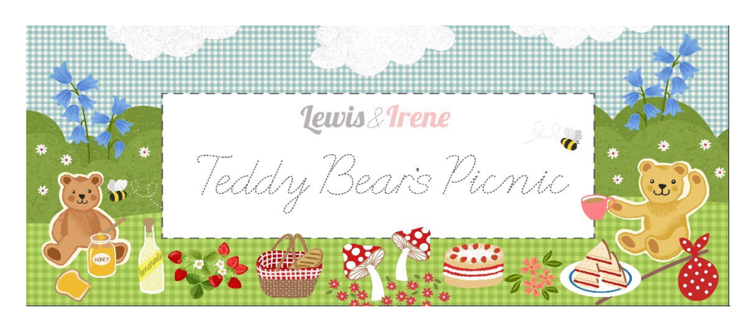
Designed and made by Sally Ablett - Throw 1

Size of runner 50" x 50" - unfinished block size 24\frac{1}{2} " x 24\frac{1}{2} " - 12\frac{1}{2} " x 12\frac{1}{2} "