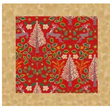
Corner blocks - 4