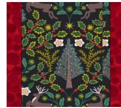
Block 4 - 14

Corner blocks - stitch a strip to the top and bottom of the square, press back and then the top and bottom.