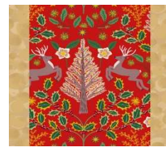
Block 4 - 14

Corner blocks - stitch a strip to the top and bottom of the square, press back and then the top and bottom.