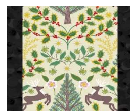
Block 4 - 14

Corner blocks - stitch a strip to the top and bottom of the square, press back and then the top and bottom.