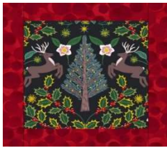
Corner blocks - 4