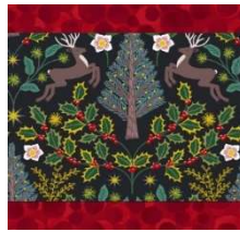
Block 3 - 14