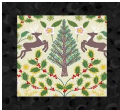
Corner blocks - 4