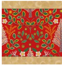
Block 3 - 14