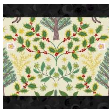
Block 3 - 14