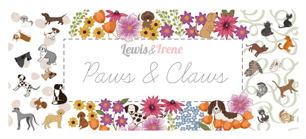
Designed and made by Sally Ablett - quilt 1 Size of quilt 50" x 50" - unfinished block size 8\frac{1}{2} " x 8\frac{1}{2} "