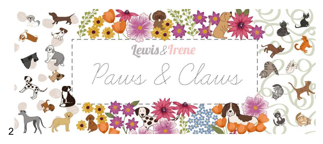
Designed and made by Sally Ablett - quilt 1 Size of quilt 50" x 50" - unfinished block size 8\frac{1}{2} " x 8\frac{1}{2} "