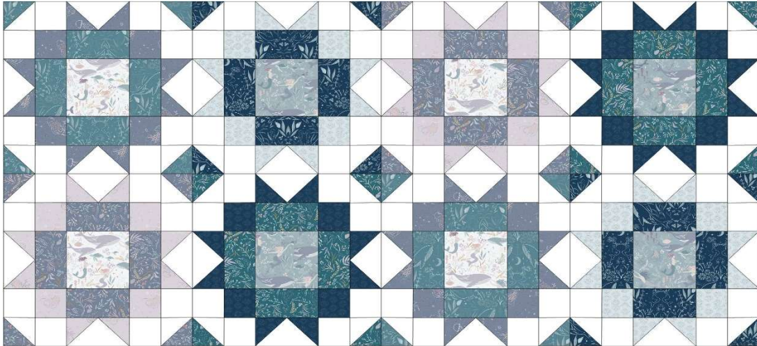
Rows 1 & 2

Place the blocks out as in the main diagram. Sew in rows pressing the seams in the opposites way each time as this will help when stitch the rows together.